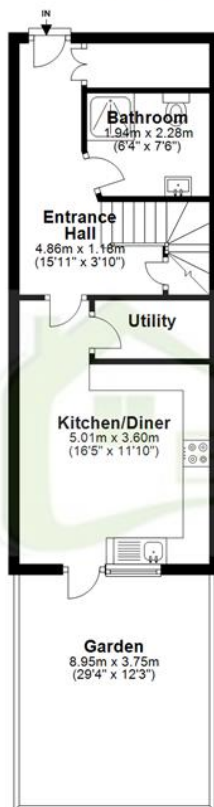
Ground Floor Approx. 35.6 sq. metres (383.3 sq. feet)